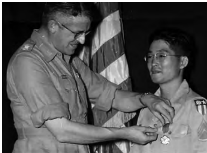
Screen capture from the film's Kickstarter site at http://tiny.cc/8bxj6w .

There is much to recommend about this short film—Wakaji Matsumoto's photographs of life in both California and Hiroshima wonderfully illustrate the hard work of immigrants, the importance of education, and the militarization of Japan.